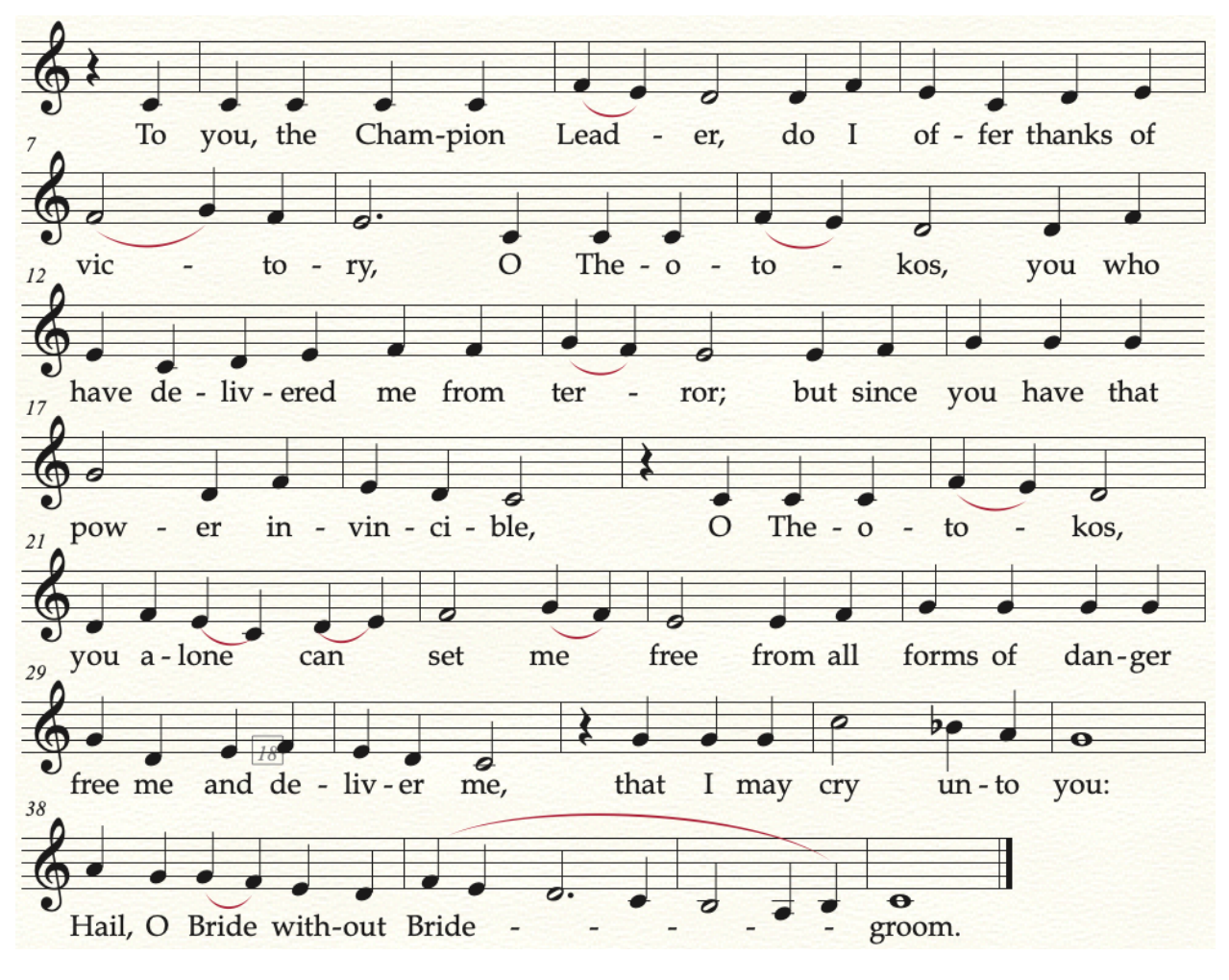
Annunciation Kontakion: Tone 8 (Byzantine, Special Melody)