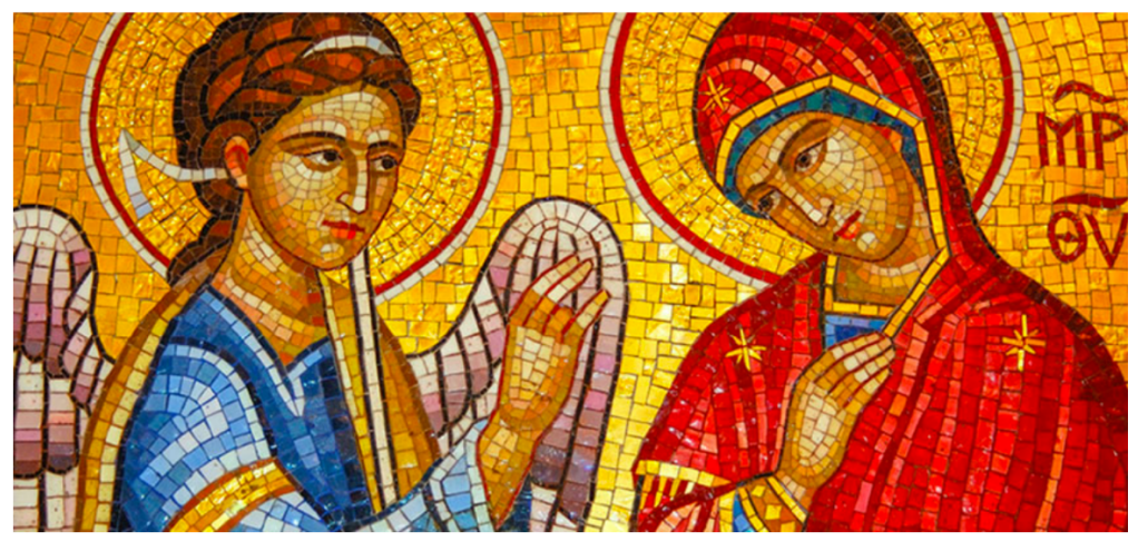
The Annunciation to the Most Holy Theotokos

Rejoice, womb of the divine incarnation. Rejoice, for through you creation is made new; Rejoice, you through whom the Creator becomes a newborn child. Rejoice, O Bride without bridegroom!